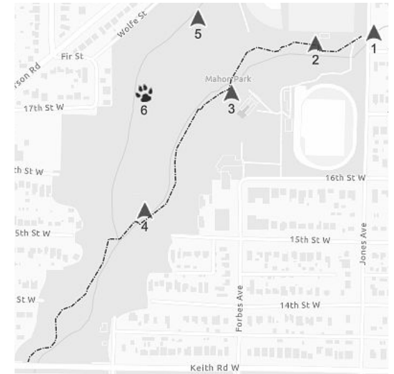
CLUES 5 AND 6 ARE DESIGNED TO BE COMPLETED ONLINE - DETAILS ON PAGE 2